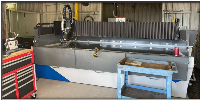
New 5-Axis Water Jet 5'x10'x12" Capacity